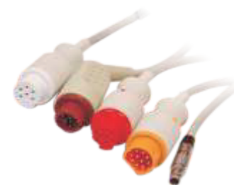
Cables available for all types of monitors